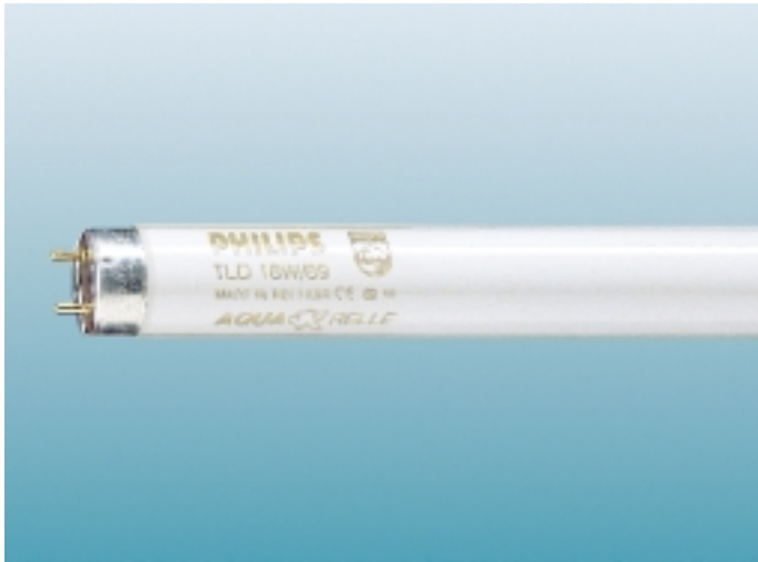
'TL'D Ø 26 mm